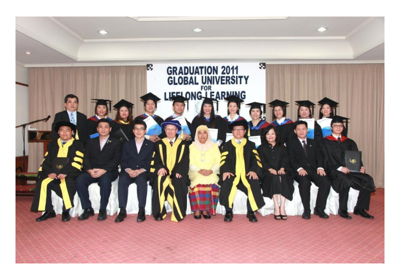
(Above) Chantel Academy graduates from Johor Bahru, Malaysia