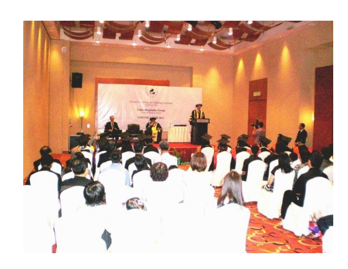
(Above) Value Hospitality CBS and GULL graduation event.

Value Hospitality currently manages 7 hotels and resorts in Malaysia and several years ago the company established the foundations of its own corporate business school (CBS) by embracing action learning and the GULL system.