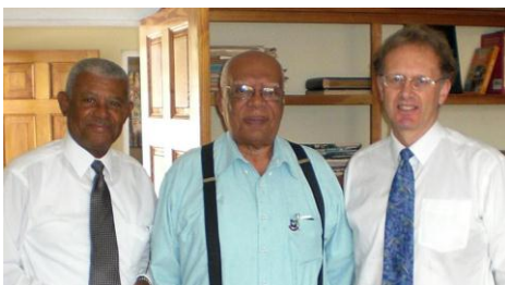
GULL's mission is endorsed by Sir Howard Cooke, (centre) former Governor General of Jamaica

GULL is established to extend opportunities for learning and human capital development around the world, particularly to those people and communities underserved by traditional approaches to academic education and workplace training. We face great challenges in this century, as identified by the United Nations 'Millennium Development Goals' and other initiatives – calling for broad and sustained efforts to create a shared future, a recognition of a common humanity in all its diversity, and the objective that participation in the global economy be made fully inclusive and equitable. We believe that the solutions to the economic and environmental issues facing mankind will be more forthcoming and more comprehensive by engaging more and more of the earth's population in the dialogue of what each of us needs to learn in order to be a better person and achieve our personal goals. We are all created equally to live fully and to serve and respect one another. GULL is founded on the principle that each of us, given the opportunity and resources, holds the innate capacity to know what we want to learn and need to learn to lead a more fulfilling life. Our simple mission is to expand human capital development through innovative means – dependent not on technology, but on the human spirit.