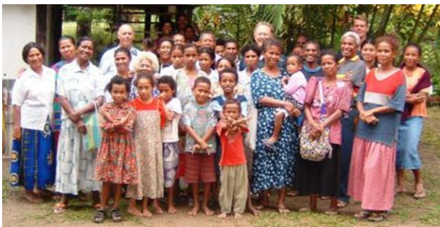
Villagers in Kemabolo, Papua New Guinea

Sir Paulias has been advocating to PNG leaders, and to other Papua New Guineans, that its national economy should be strengthened by revitalizing its agriculture and tourism sectors. He views tourism as the single biggest potential source of income for PNG.